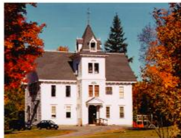
Above: One of the many interesting buildings in Parsonsfield village near the Parsonsfield Seminary.

Road conditions: Generally good; broken pavement on ME 160 south of the Ossipee River.