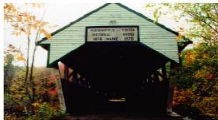
Above: Parsonsfield-Porter covered bridge. This bridge is on the National Historic Register; it crosses the Ossipee River and was built in 1876 (re-furbished in 1970).

Special features: Pretty villages of Cornish and Maplewood; spectacular mountain and river views; Porter-Parsonsfield Covered Bridge; Willowbrook Country Museum in Newfield; gracious old homes in North Parsonsfield.