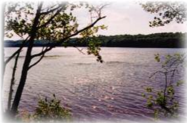
Left: One of many views as you ride along Merry Meeting Bay