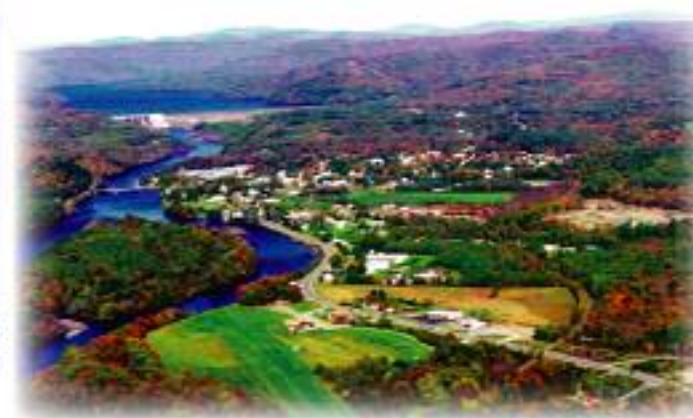
Above: The town of Bingham with Wyman dam in the background.